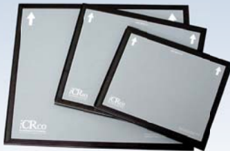
iCR Flat Scan Path™ IP Cassettes